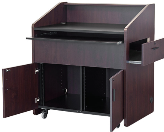
Flat Top Shown

Top rear removable, intended to easily be mounted in a wedge position or as flat large work surface, that can support monitors laptops and room control systems.